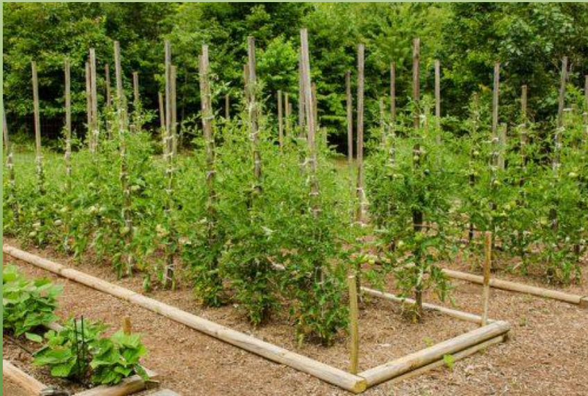
Tomatoes tied to poles