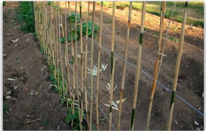
Pole beans on poles wired together