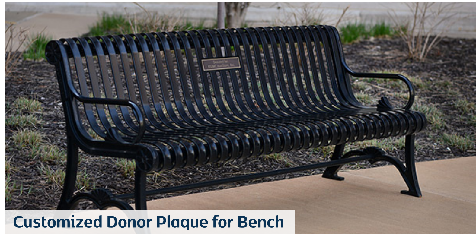
Customized Donor Plaque for Bench