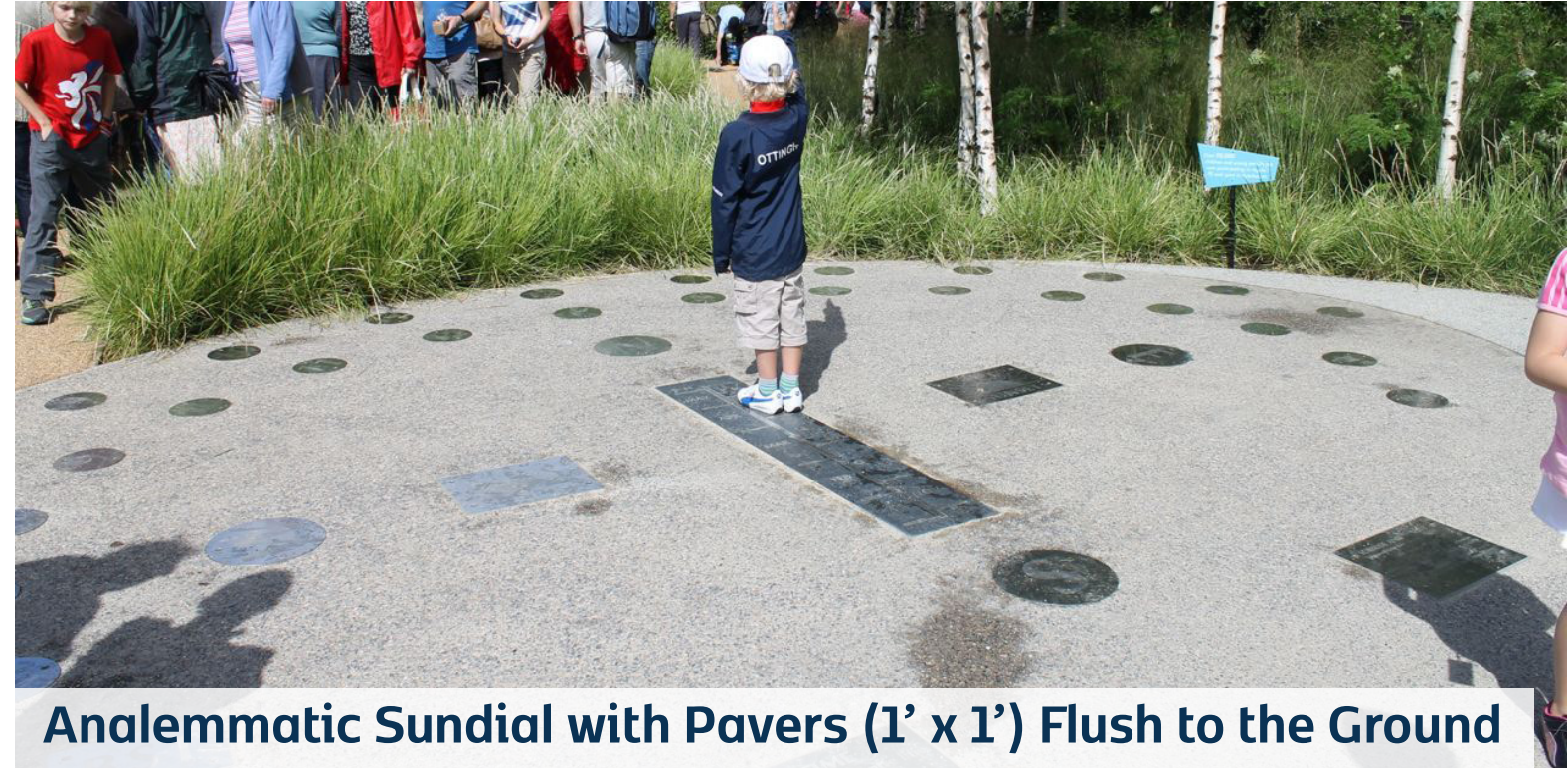
Analemmatic Sundial with Pavers (1' x 1') Flush to the Ground