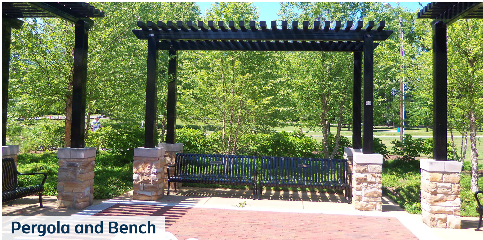
Pergola and Bench